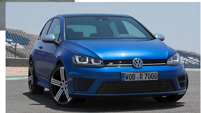
VW Golf Mk7 2013