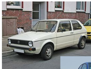
VW Golf Mk1 1974

Whilst we are covering Red Dot awards. The Volkswagen Golf has also picked up one of these awards in 2013. The jury statement read - The new Golf presents itself in a progressive and modern way. Thanks to its unmistakable, brand-typical design language, however, the car renders a familiar impression.