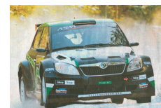
Skoda Fabia S2000

This should make it an appealing family vehicle particularly for city running around.