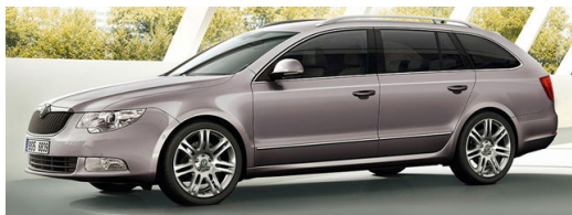
Skoda - Superb Combi

Last year - Luxury Car of the Year - the Skoda Superb Combi represented excellent value for money and was well received by several motoring critics.