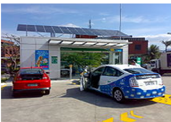
Solar energy charging station in Brazil.

Where will this alternative power supply come from? It could be solar power (see pic. at left) or it could be something like lithium ion rechargeable batteries.