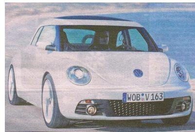
Italdesign - the New Beetle, the second generation model, due in 2012.

Volkswagen is to take a 90 per cent stake in Italdesign. As the name would indicate, this is an Italian car design company with contracts with some of the car industry's 'heavies'. Some carmakers may be nervous that VW will now have access into their confidential technology.