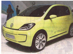
Volkswagen's E-UP, due to go into production in 2013

One of the biggest hurdles will be re-programming the drivers/buyers. You will not be able to just drive home and leave the car in the garage - you will have to plug it in, ready for your next trip out.