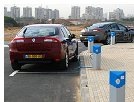
Charging station in Israel

One concern with the electric cars is that they are so quiet that the visually impaired, pedestrians and cyclists, may not hear them approaching.