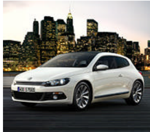
The new TSI Volkswagen Scirocco

TSI stands for - twin-charger stratified injection) Super-charged and turbocharged TSI engines are some of the most efficient petrol engines available today.