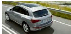
2009 Audi Q5

Audi's first hybrid vehicle is scheduled to appear in 2011 - a Q5 crossover.